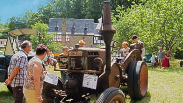
There are several themed events throughout the season