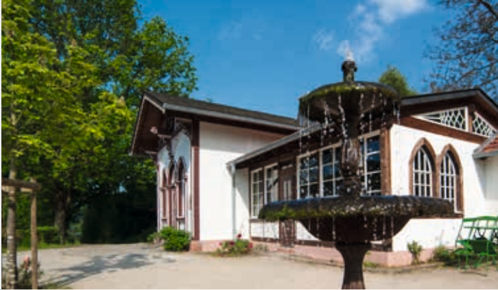
Did you ever want to rent an historic skittle alley? Here is your chance!

The museums tavern offers regional specialties. Additionally, a number of picnic areas can be found throughout the museum grounds. School classes, clubs, families and other groups can choose from a variety of