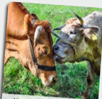
Mart and Lukas, our two oxen

Our employees are always happy to help with any questions or wishes and take into consideration criticism, hints and suggestions.