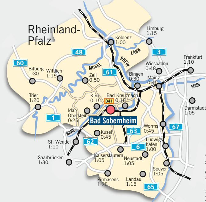
Atelier Hans-Joachim Thun, Birmen

Please visit us on event days. For example the "garden day" in the spring or the "historical end of season event" in November. Please ask us about our hands-on programs and themed guided tours for school classes, travel groups and work outings!