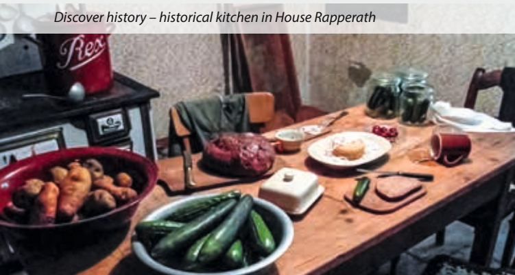
Discover history – historical kitchen in House Rapperath

MOSELLE-EIFE Eifel HUNS RÜCK-NAHE PALATINATE-RHINE HESSE MIDDLE RHINE-WESTERN FOREST