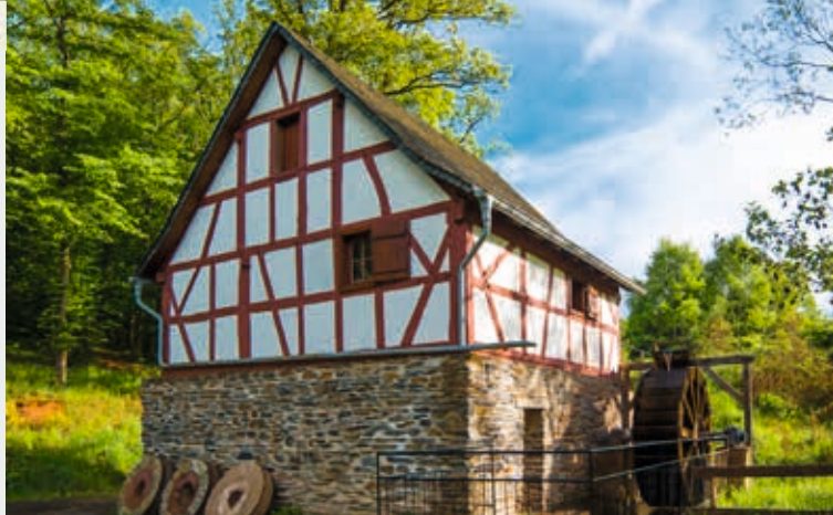
The water mill from Altküß; an exhibition regarding the mill-trade is located on the first floor of the nearby Wine Press House Briedern

Looking to buy souvenirs, literature or local and regional products? The Museum shop, located in House Wolfersweiler, has all these items in stock.