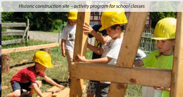
Historic construction site – activity program for school classes