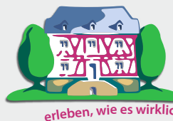
erleben, wie es wirklich war ...

Opening Hours: End of March – Beginning of November; daily except for Mondays, from 9 am – 6 pm. Last admission at 5 pm. Additionally, the museum opens Mondays: June – August, as well as during school holidays and public holidays