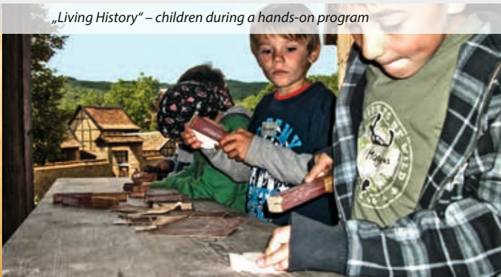
„Living History“ – children during a hands-on program